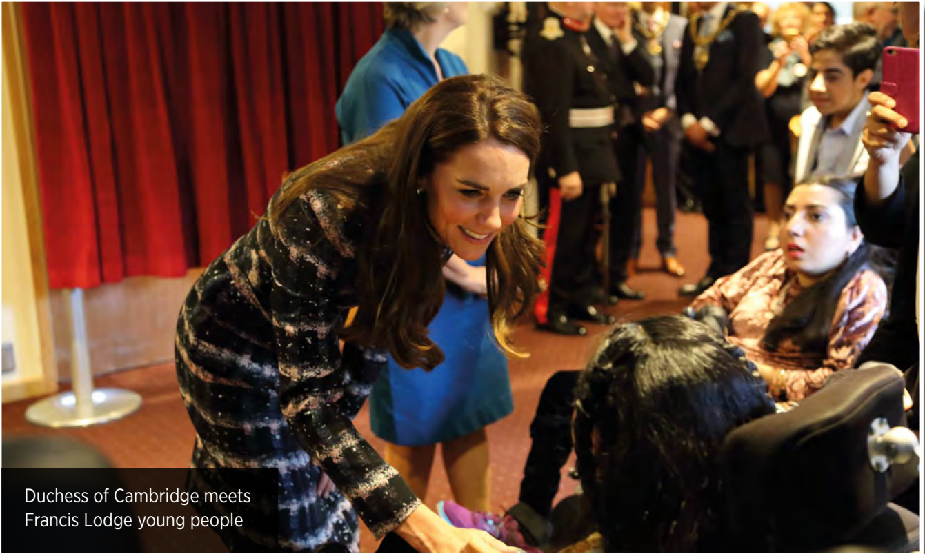
Duchess of Cambridge meets Francis Lodge young people