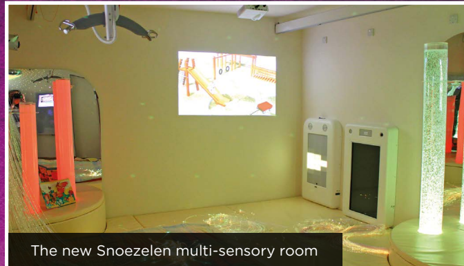
The new Snoezelen multi-sensory room

Visitors are often surprised to hear that less than ten per cent of the children have cancer related conditions.