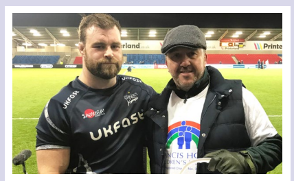
SALE SHARKS MATCH DAY COLLECTION £943