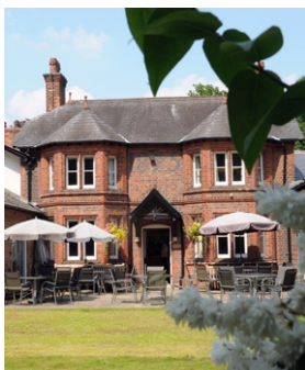
Knutsford Golf Club Ladies competition £240