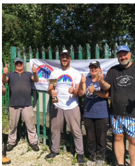
Reddish Angling Club 24-hour fishathon £1,508