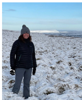
Weightmans Charity of the Year Lapland Walk £900+