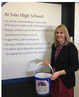
Sale High School Non uniform day