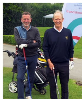
Prestbury Golf Club Captain's Day