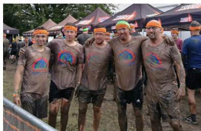
TOUGH MUDDER & LIDL MUDDER 4-5TH SEPTEMBER