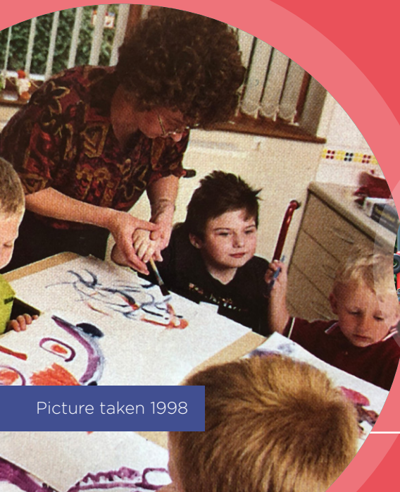
Picture taken 1998

"After almost three decades I still love coming to work."