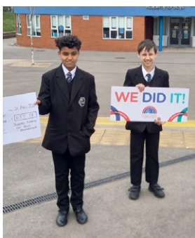
Burnage Academy for Boys Y7 sponsored mile run