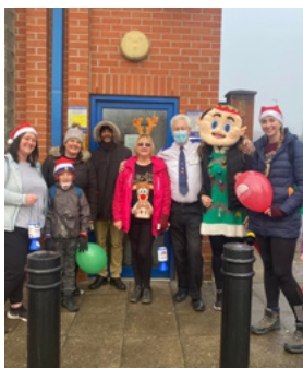
KidSmart Learning Centre Sponsored walk