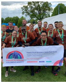
Oldham Bronchomania Born Survivor