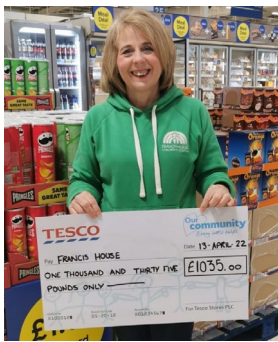
Tesco Stockport Book table

Francis House is a lifeline to more than 550 families from across the North West. When life is short it needs to be of the highest quality and that's what Francis House does best.