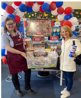
Hobbycraft Stockport and Altrincham Jubilee art and craft supplies