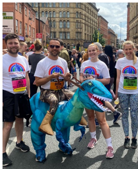
Weightmans LLP Great Manchester Run team £1,475