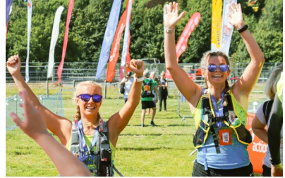
PEAK DISTRICT ULTRA CHALLENGE 8-9TH JULY