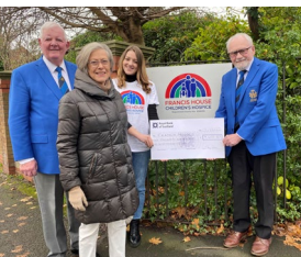
Withington Golf Club £9,607