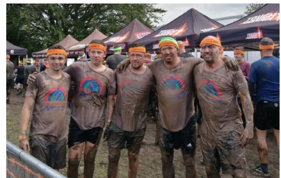
TOUGH MUDDER 15-16TH JULY