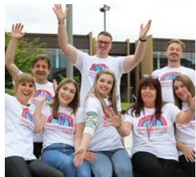
Texere Publishing SEPTEMBER challenge £816