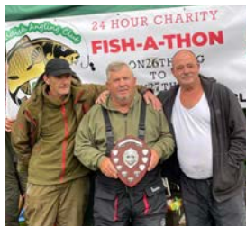
Reddish Angling Club 24 hour Fish-A-Thon £2,600