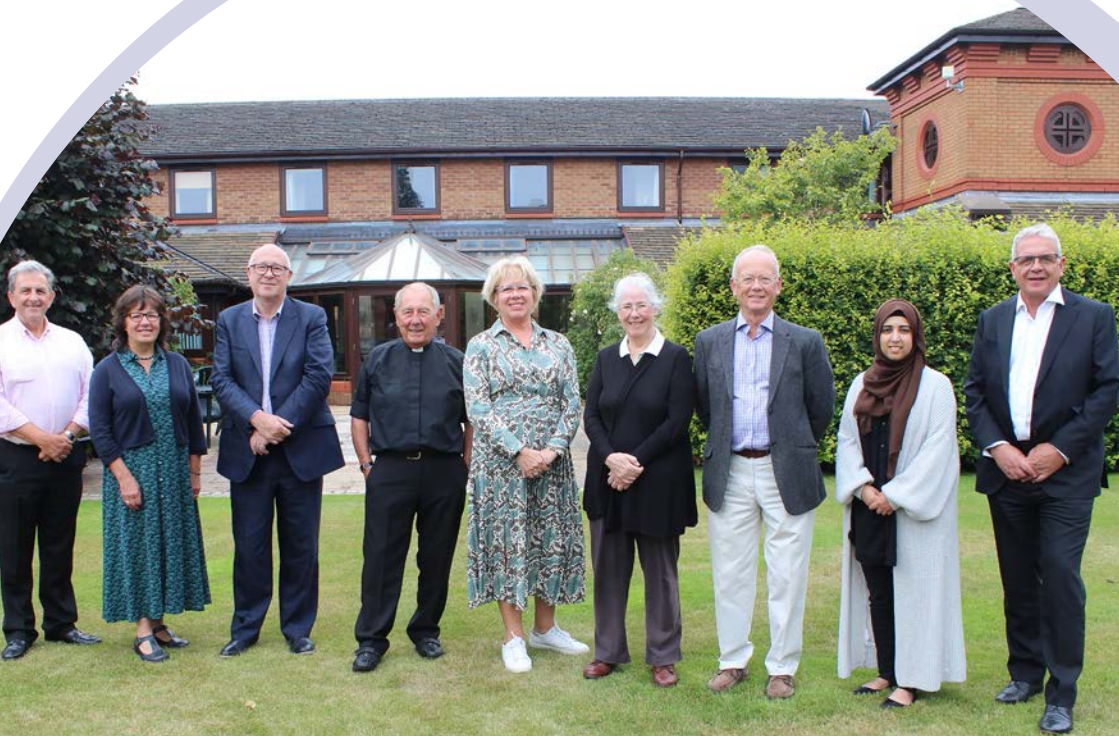
The board of trustees at Francis House