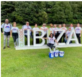
Classic Ibiza merchandise sales £2,100