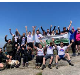
Portman Recruitment Peak District Challenge £2,375