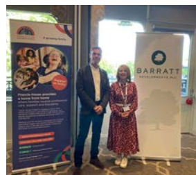
Barratt Homes, Manchester Annual Golf Day and Dinner £21,407