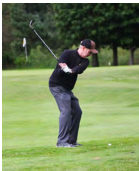
Irish Association Golfers Charity Day