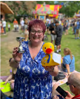
Bramhall & Woodford Rotary Club Duck Race & Family Fun Day

Francis House is a lifeline to more than 600 families from across the North West. When life is short it needs to be of the highest quality and that's what Francis House does best.