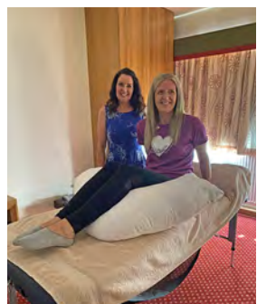
The Stephanie Glynn Foundation Therapy Room donation