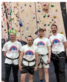
Oppio Lounge Climbing Challenge